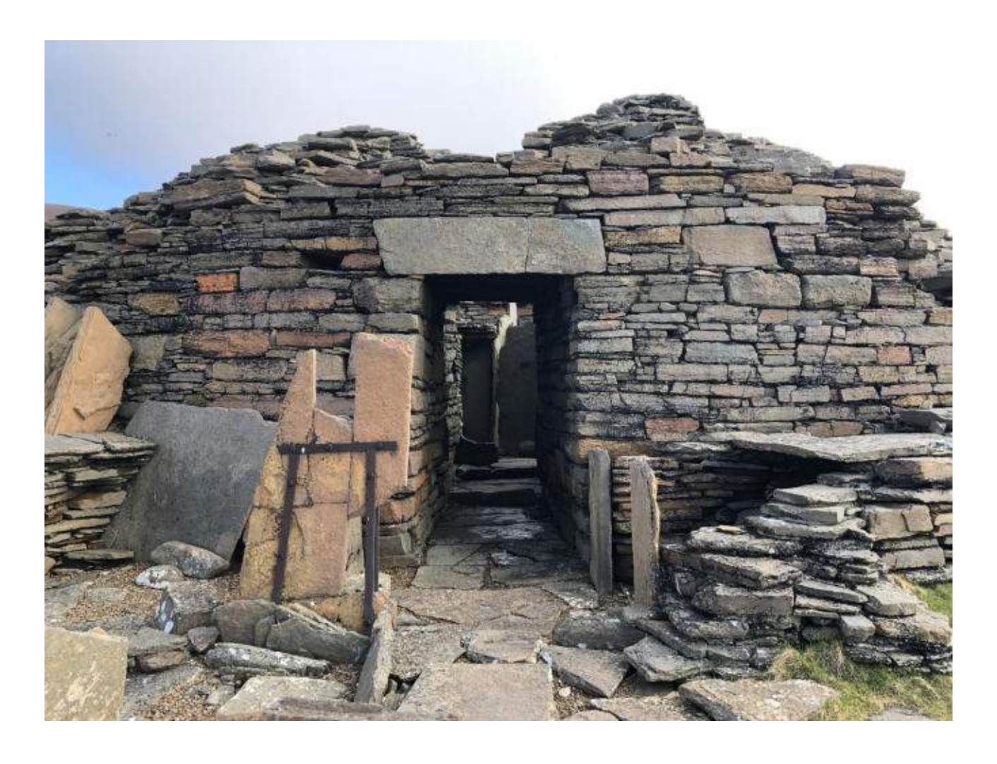
Plate 27: View east into entrance of Midhowe Broch, Rousay, HES PiC (Asset 129)