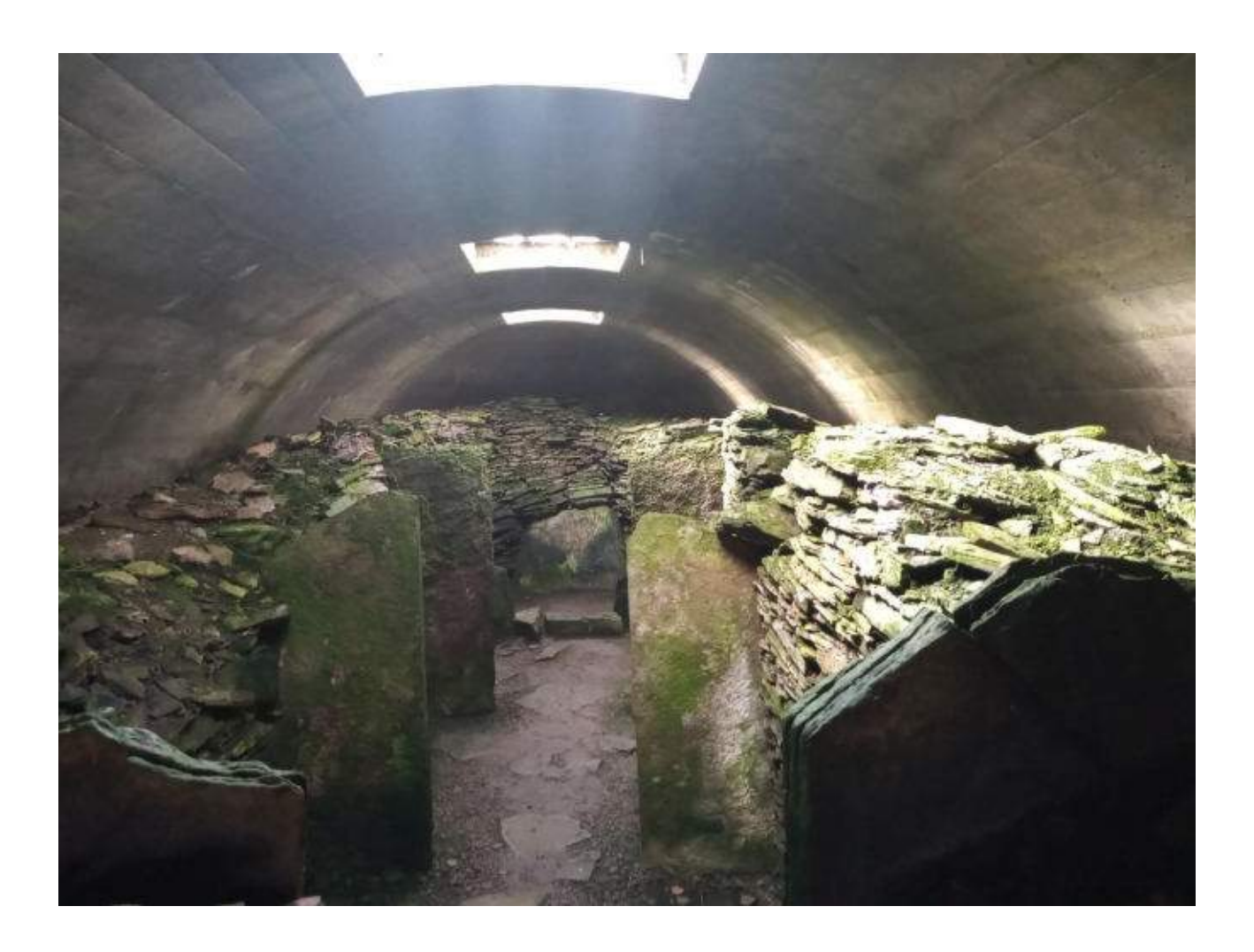
Plate 30: View northwest within bunkered Knowe of Yarso Chambered Cairn, Rousay, HES PiC (Asset 128)