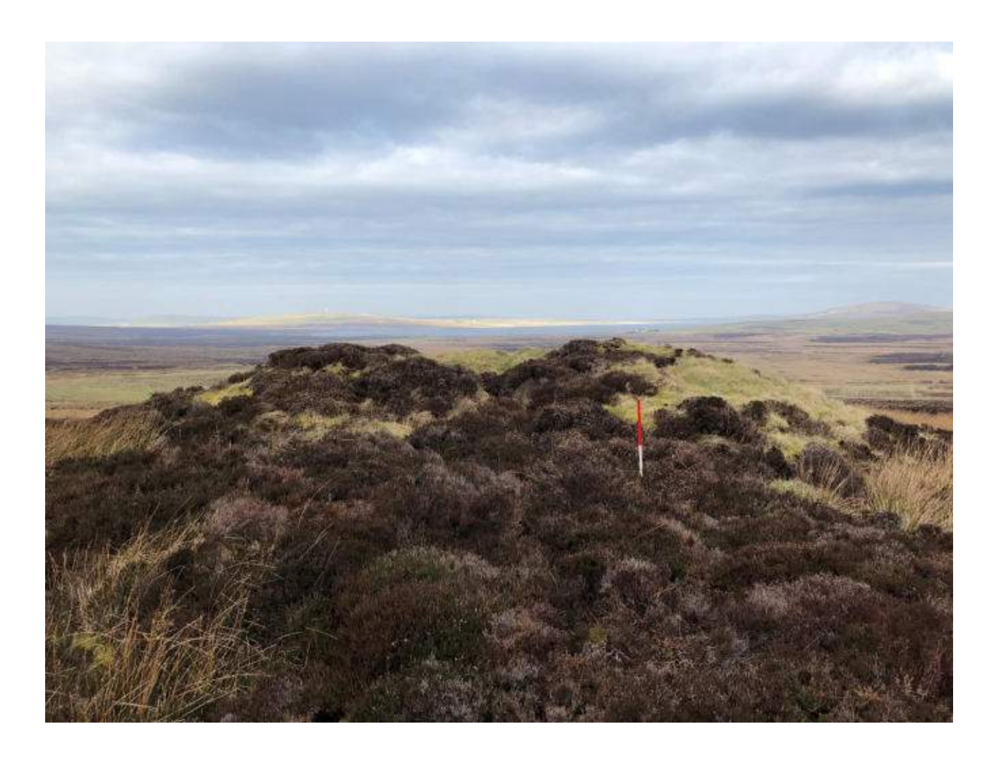
Plate 25: View northwest of Howana Gruna burial mound (Asset 30) towards the site