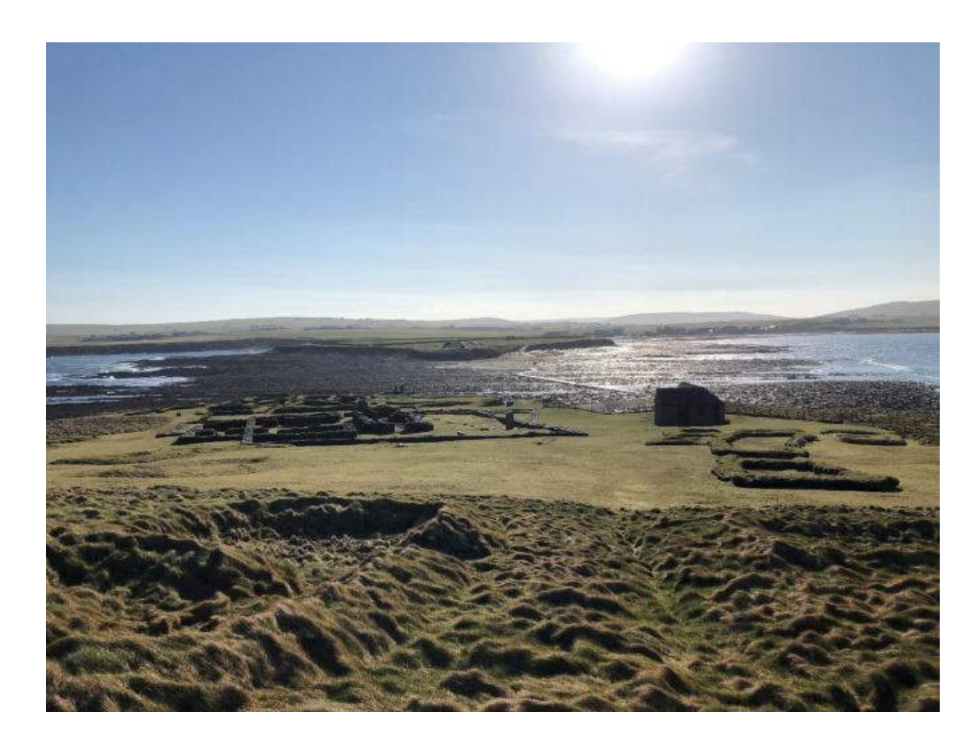
Plate 20: View east from the Brough of Birsay