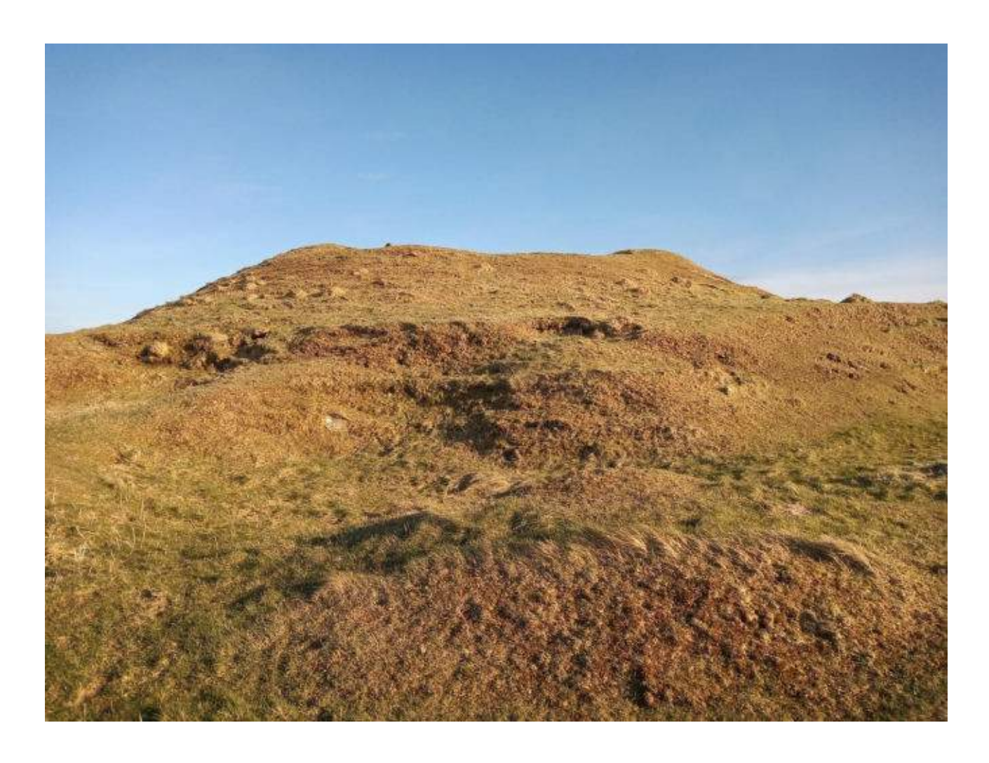
Plate 17: View west of Vinquin broch mound (Asset 114)