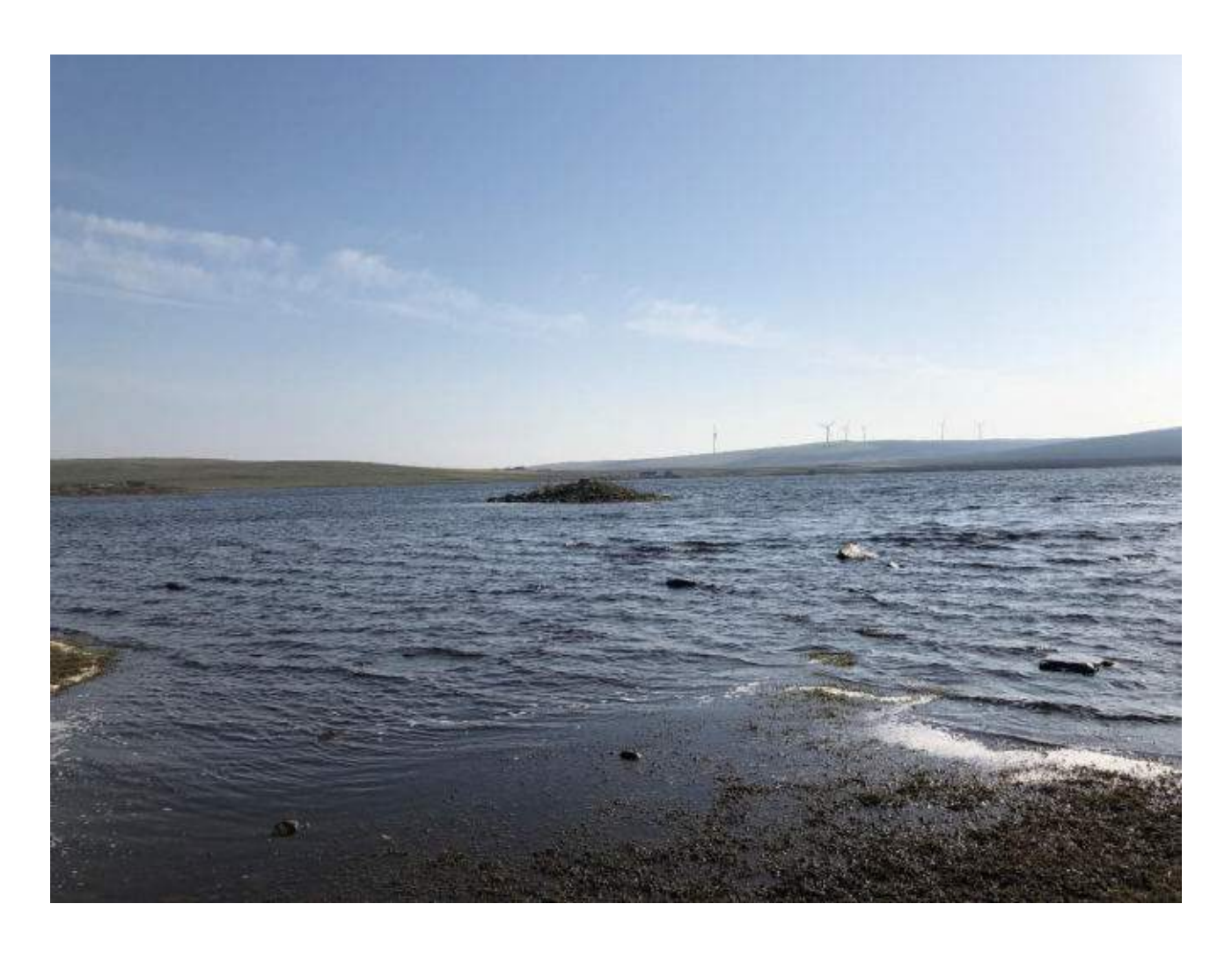
Plate 4: View from site northeast of Stoney Holm (Asset 83)