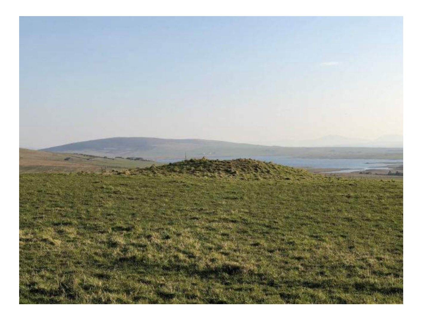
Plate 15: View southwest of Mittens burial mound (Asset 67)