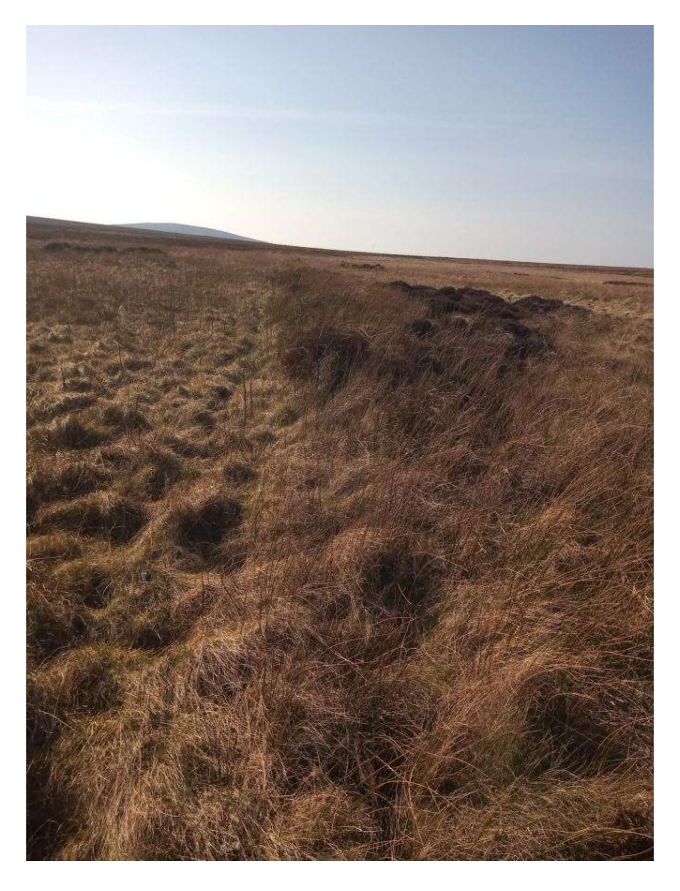
Plate 9: View northwest of remains of probable post-medieval enclosure (Asset 164)