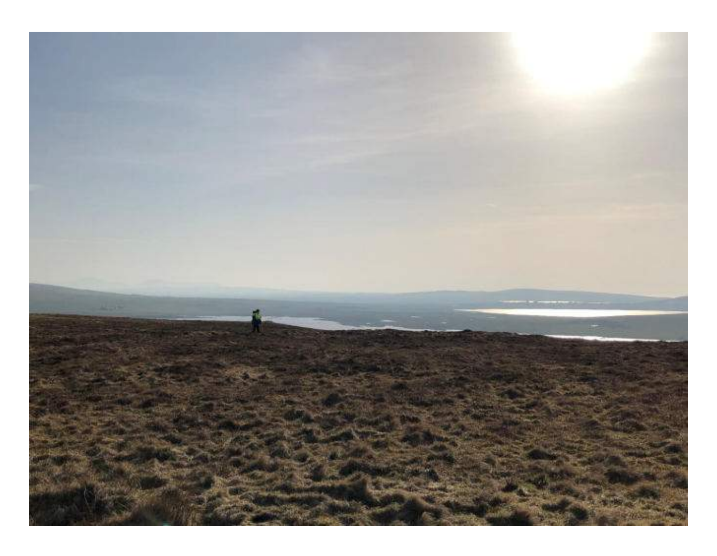
Plate 1: View southwest within Hundland Hill Enclosure (Asset 65)