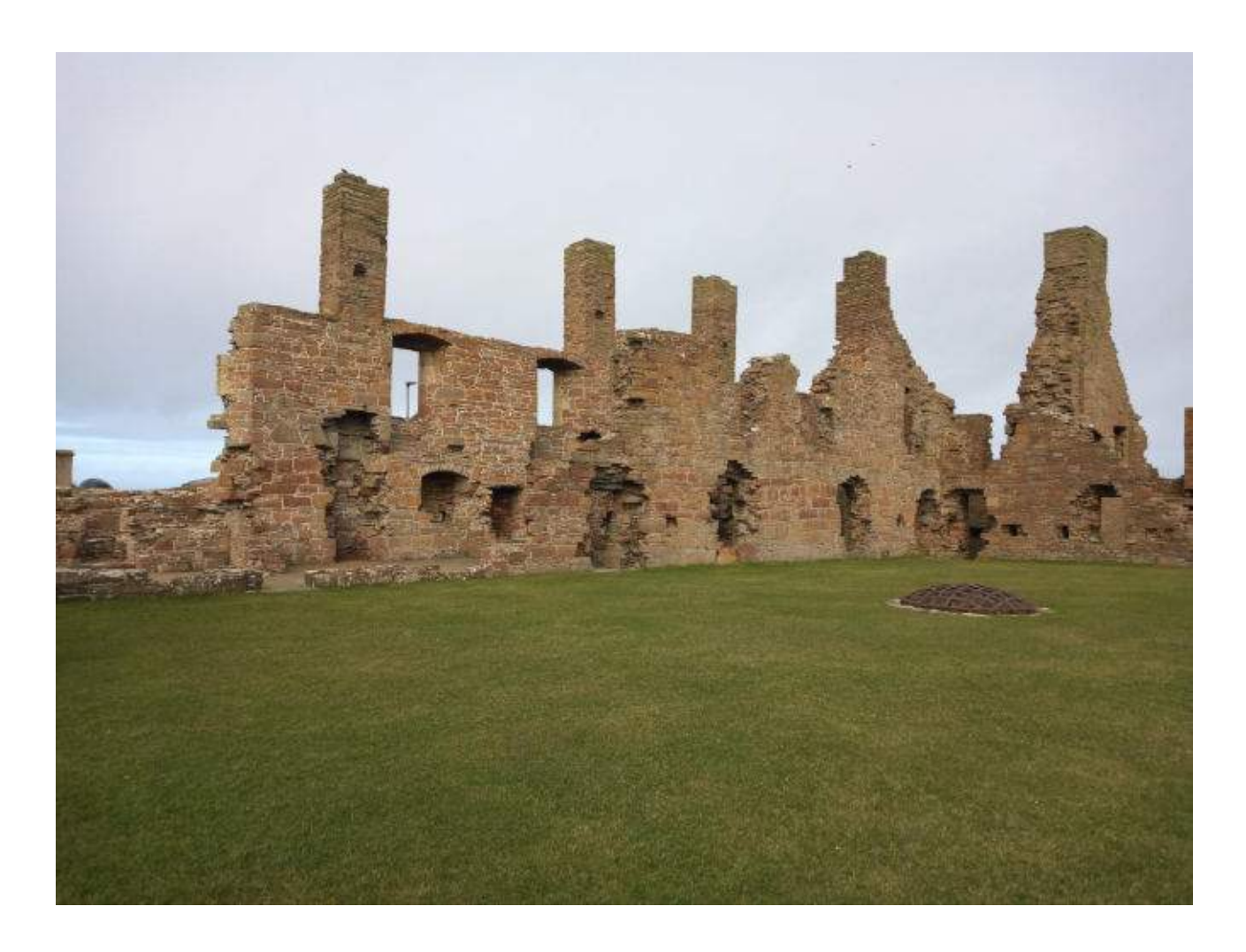
Plate 23: View northwest of Earl's Palace HES PiC (Asset 123) Long Gallery