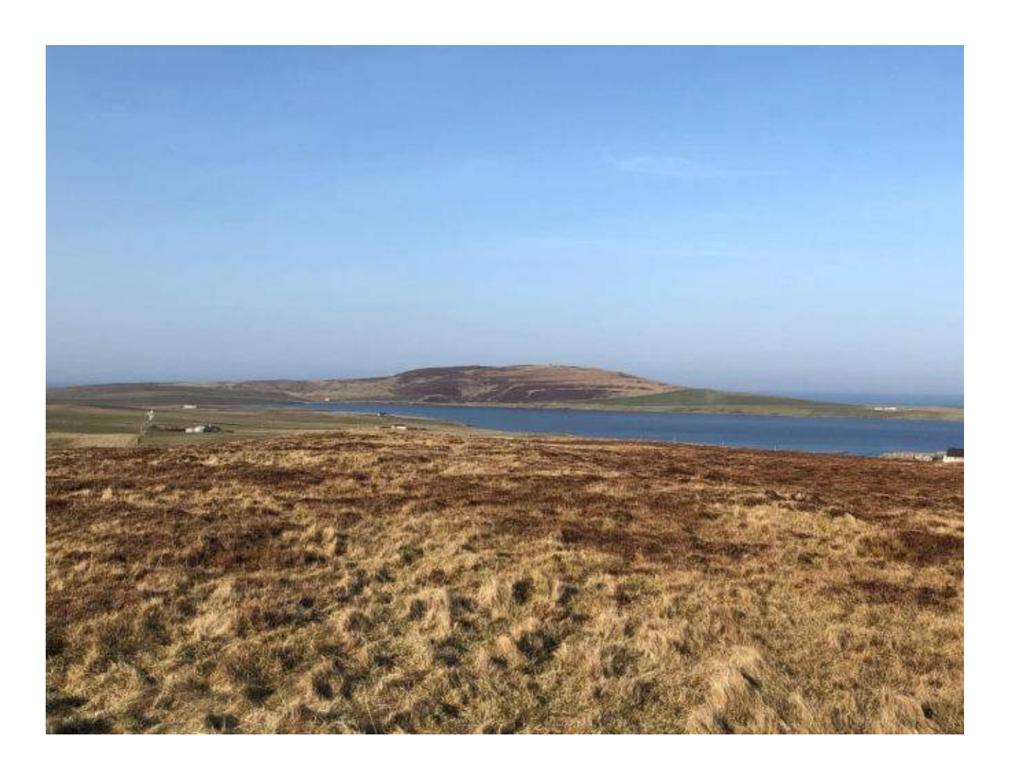
Plate 14: View from Hundland Hill Enclosure (Asset 65) to Costa Hill