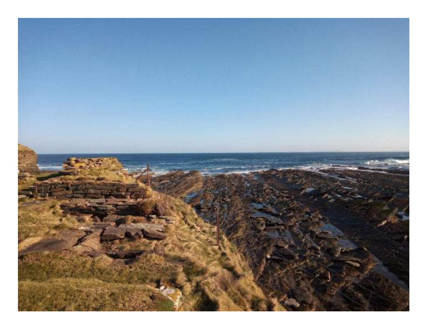
Plate 21: View north from the Brough of Birsay HES PiC s(Asset 124) showing cut off caused by coastal erosion