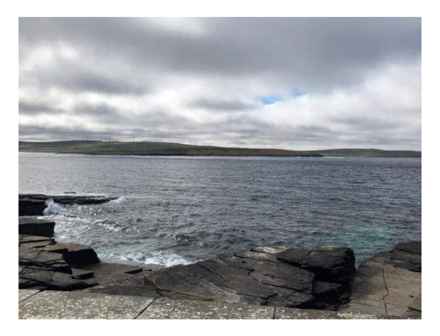
Plate 28: View west Midhowe Broch, Rousay, HES PiC (Asset 129) to Eynhallow Island and the Orkney Mainland