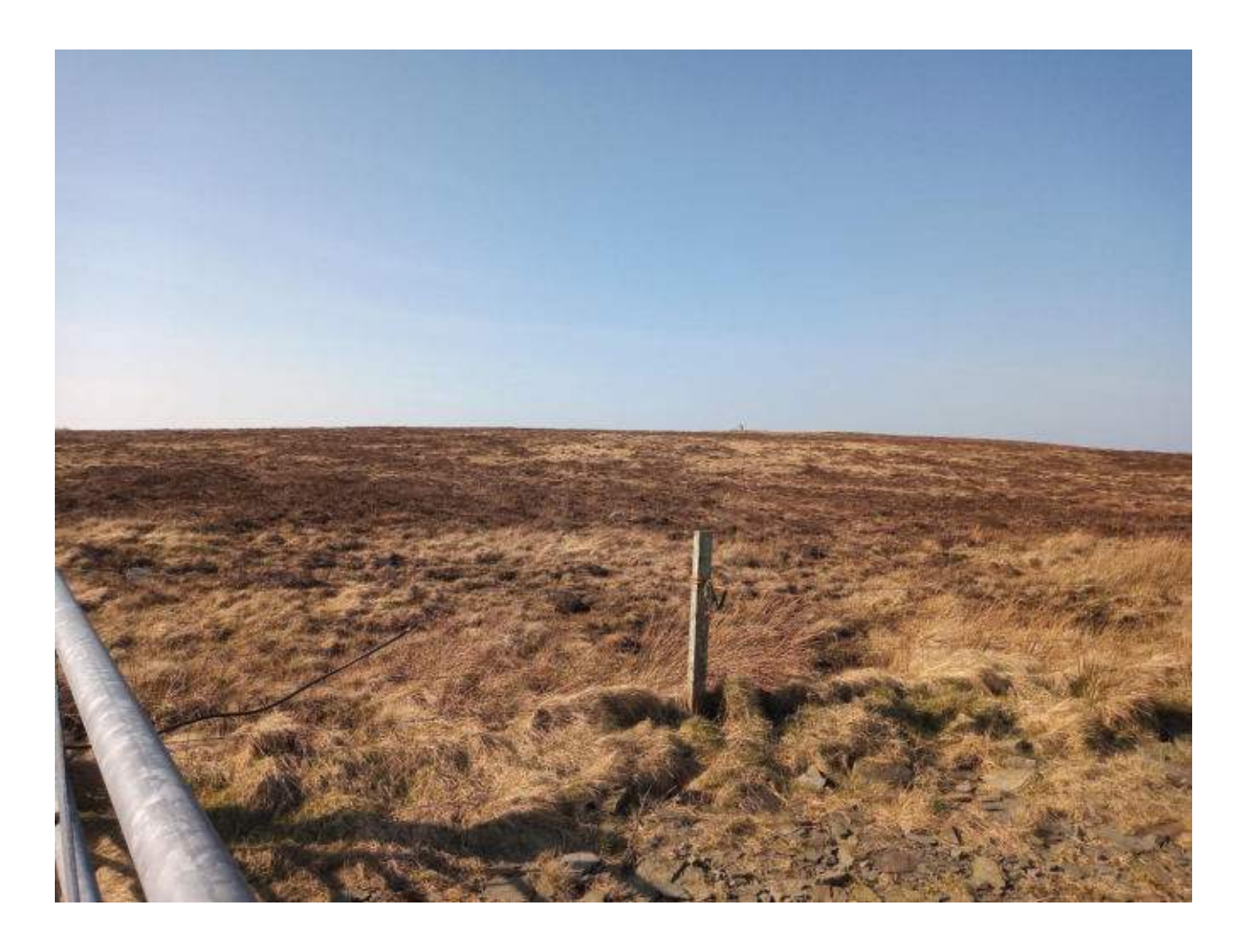
Plate 7: View northeast within site towards Hundland Hill Enclosure (Asset 65); Ordnance Survey Trig point in view