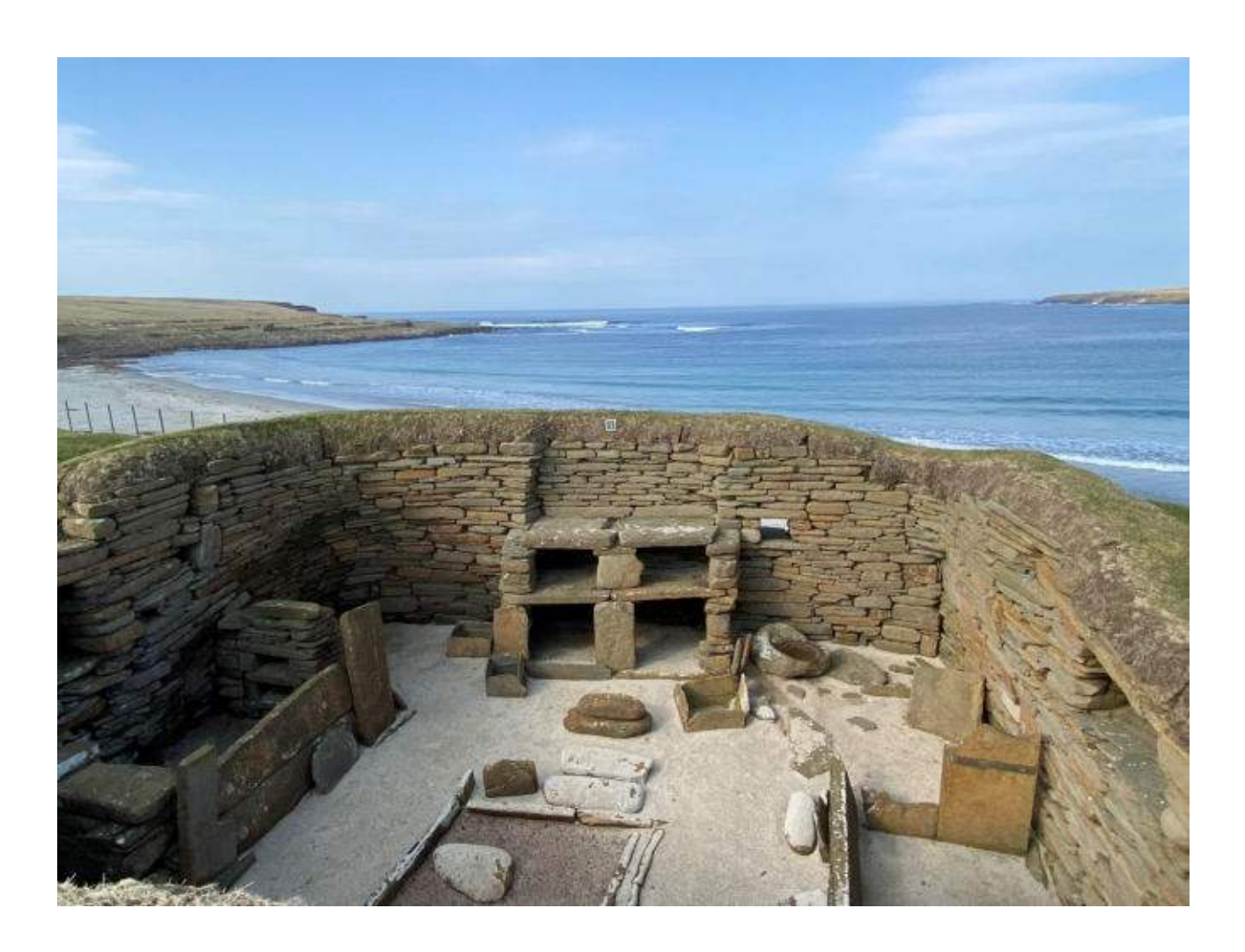
Plate 19: View northwest of House 1, Skara Brae HONO WHS and HES PiC (Asset 149)