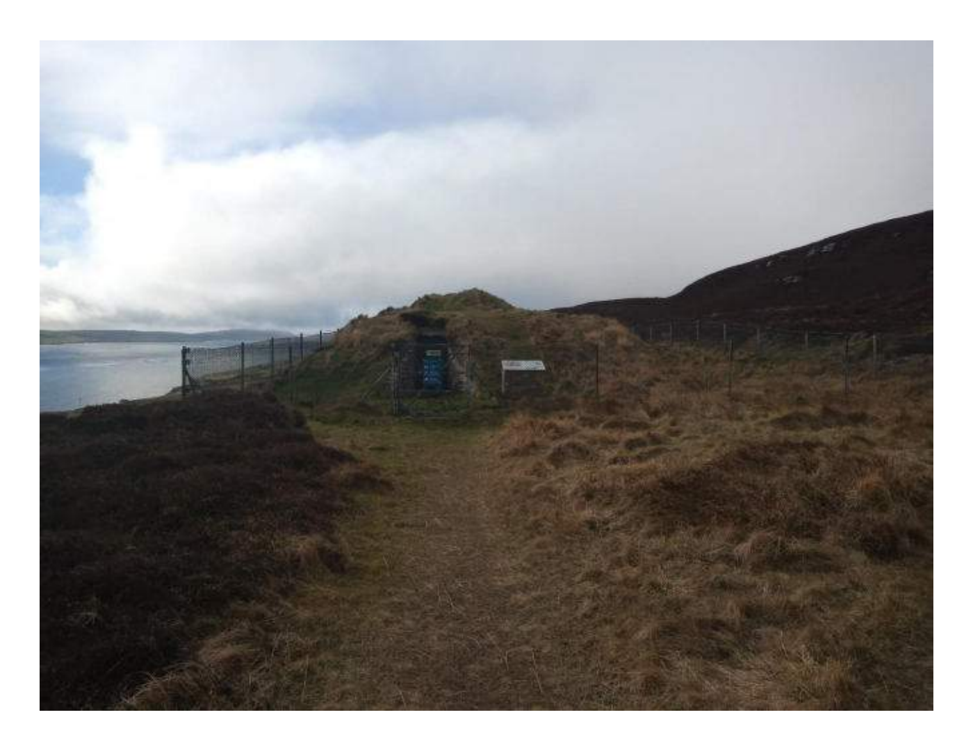
Plate 29: View northwest of the Knowe of Yarso Chambered Cairn, Rousay