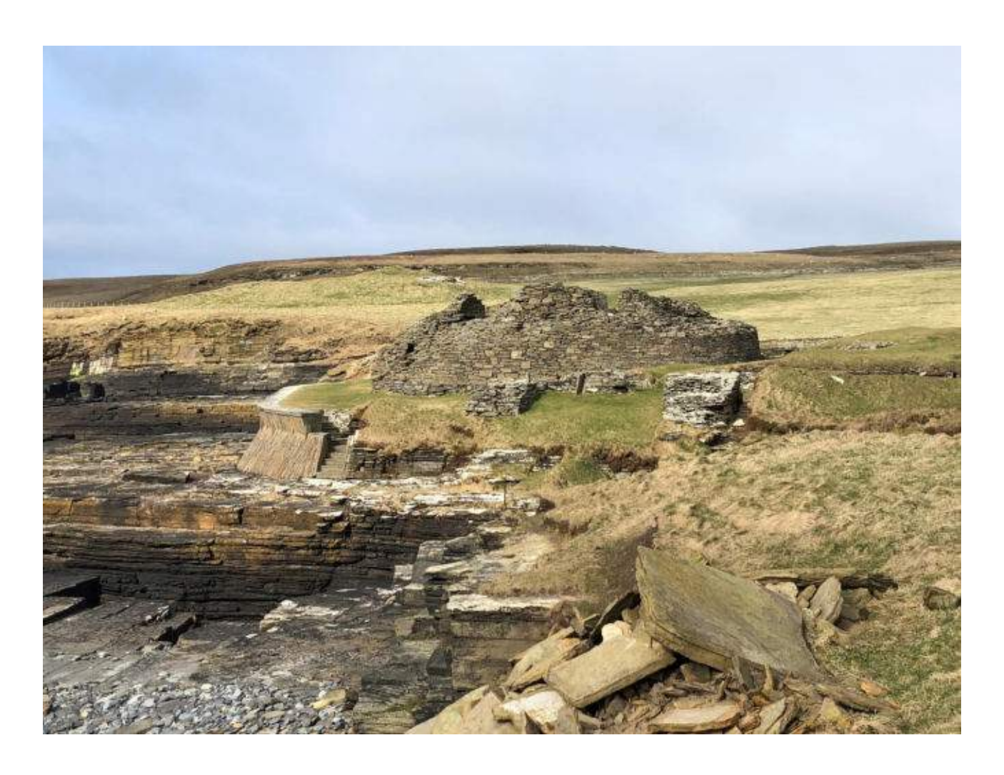
Plate 26: View north of Midhowe Broch, Rousay