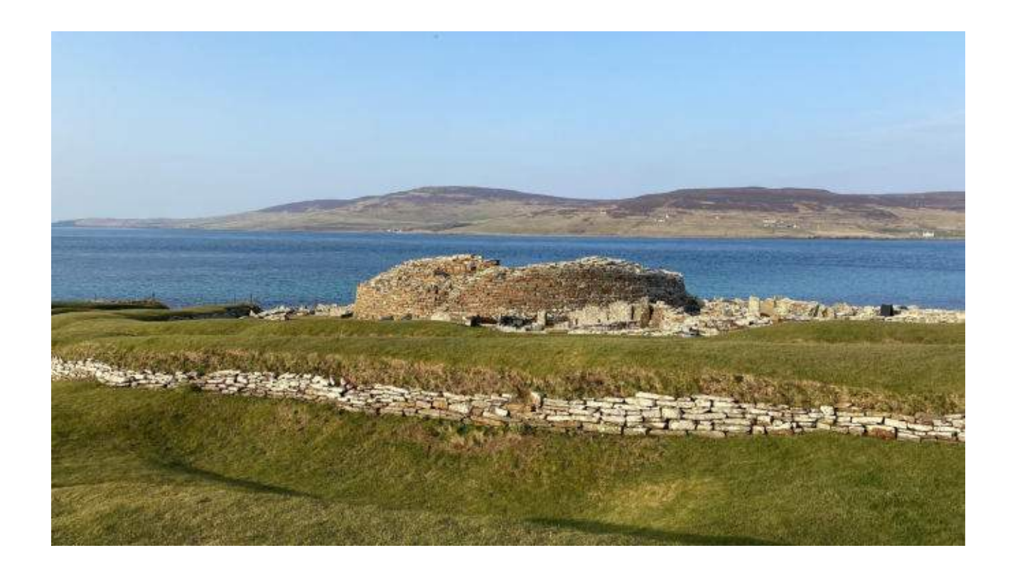
Plate 18: View north of Gurness broch