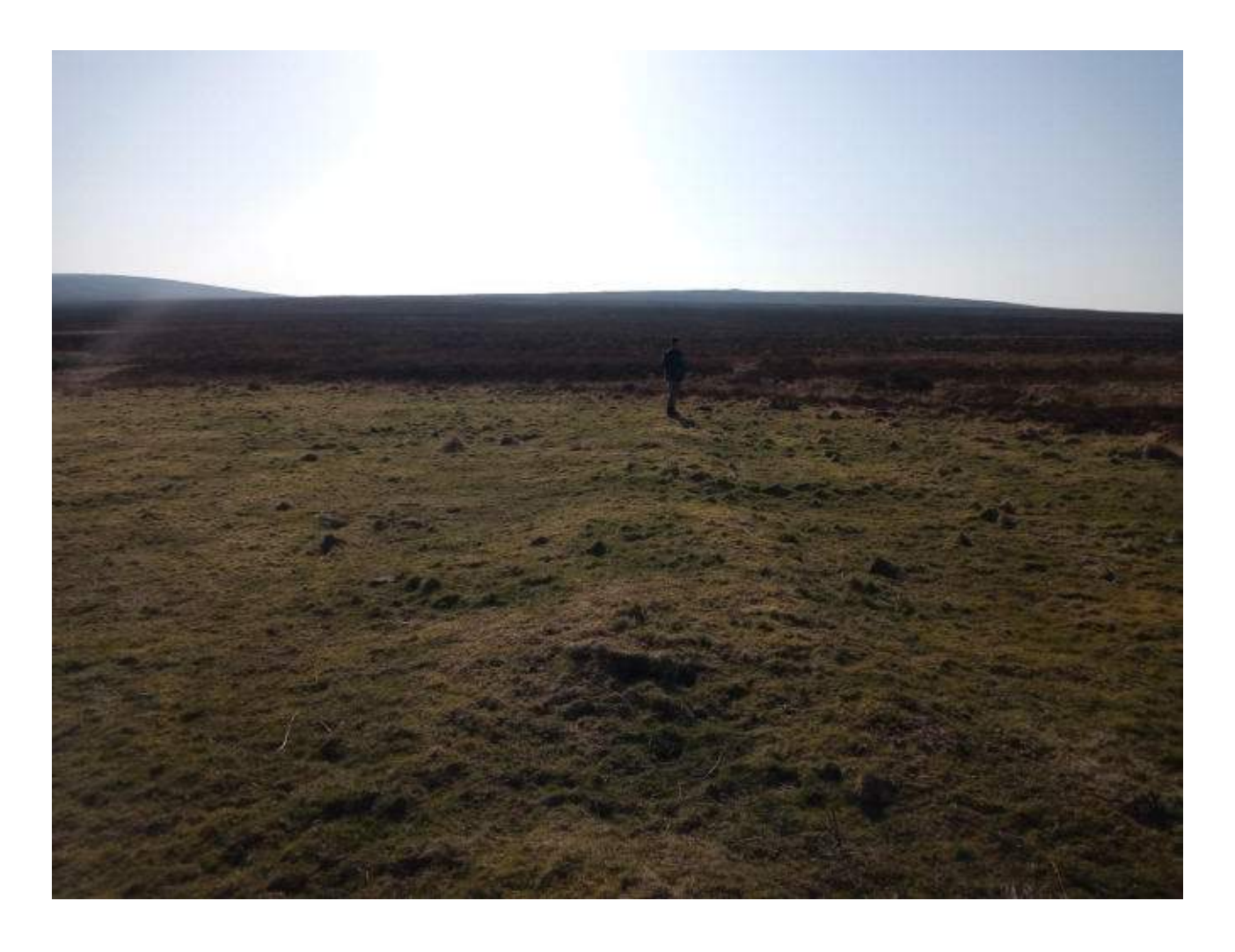
Plate 10: View west of probable post-medieval enclosure (Asset 163); Hundland Hill in background