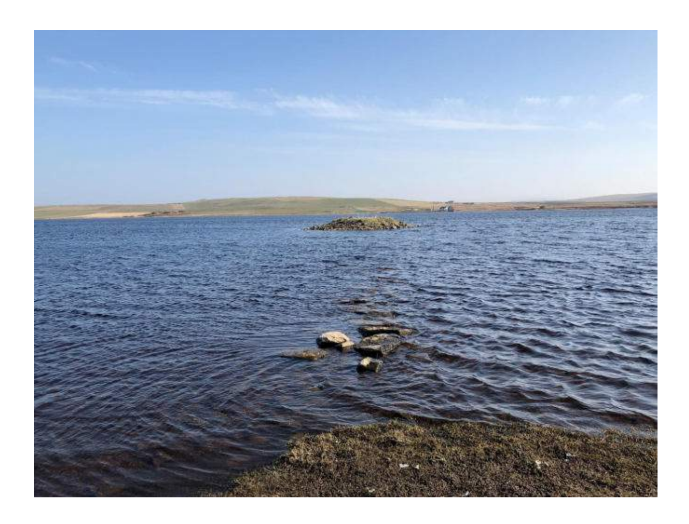
Plate 5: View from site northeast of Park Holm (Asset 72)