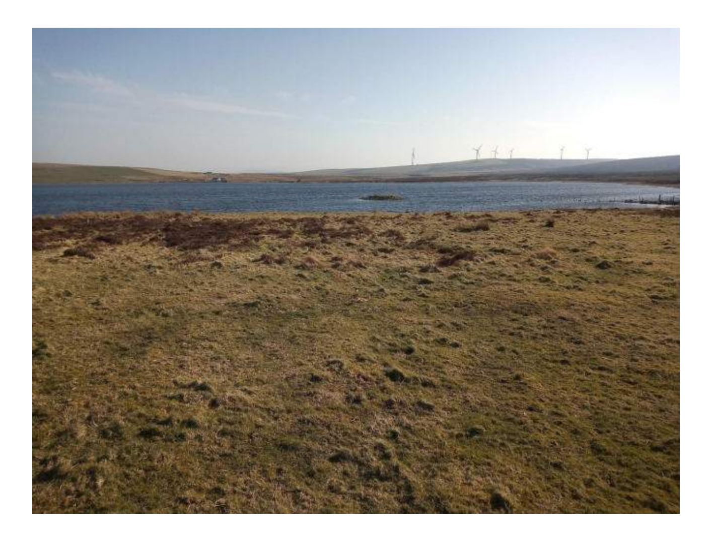
Plate 6: View southeast from site towards Burgar Hill Wind Farm; Park Holm (Asset 72) in view