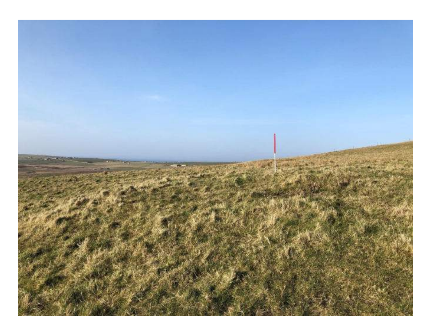
Plate 2: View north of Nisthill Burial Mound (Asset 61)