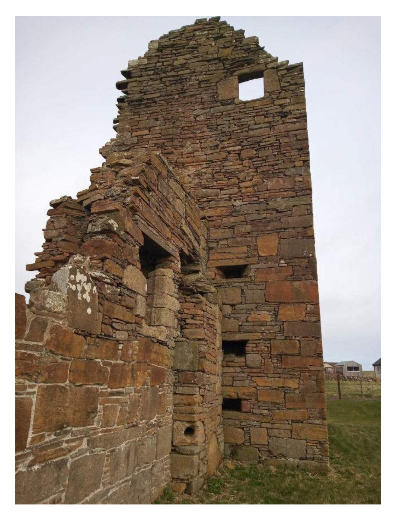
Plate 24: View north of Earl's Palace HES PiC (Asset 123) northeast corner tower