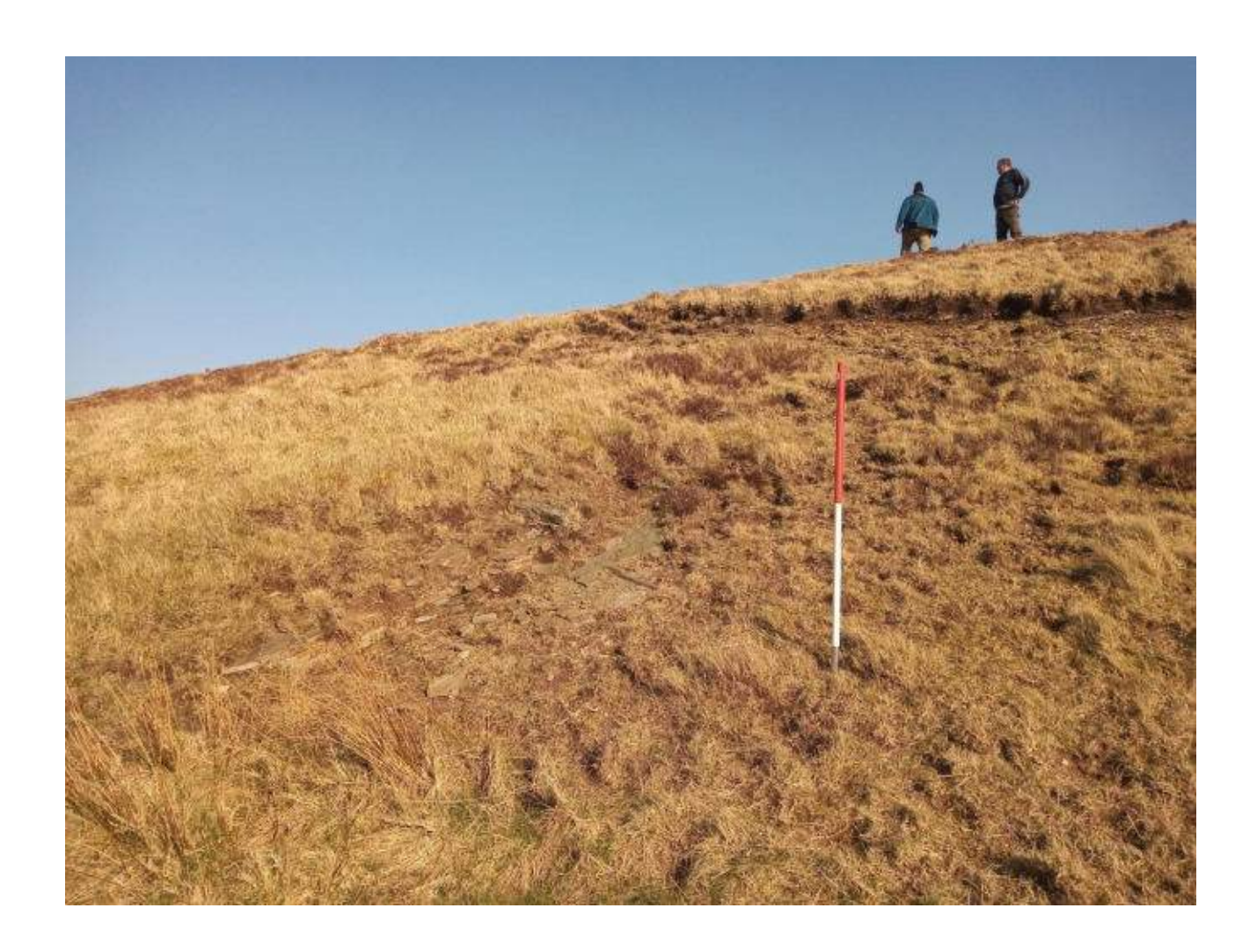
Plate 12: Probable post-medieval quarry (Asset 165); view east to Hundland Hill Enclosure (Asset 65)