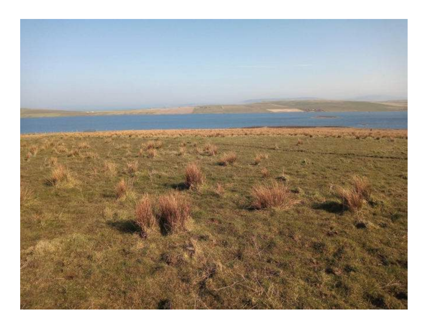
Plate 8: View east from within site to the Loch of Swannay; Muckle Holm in view