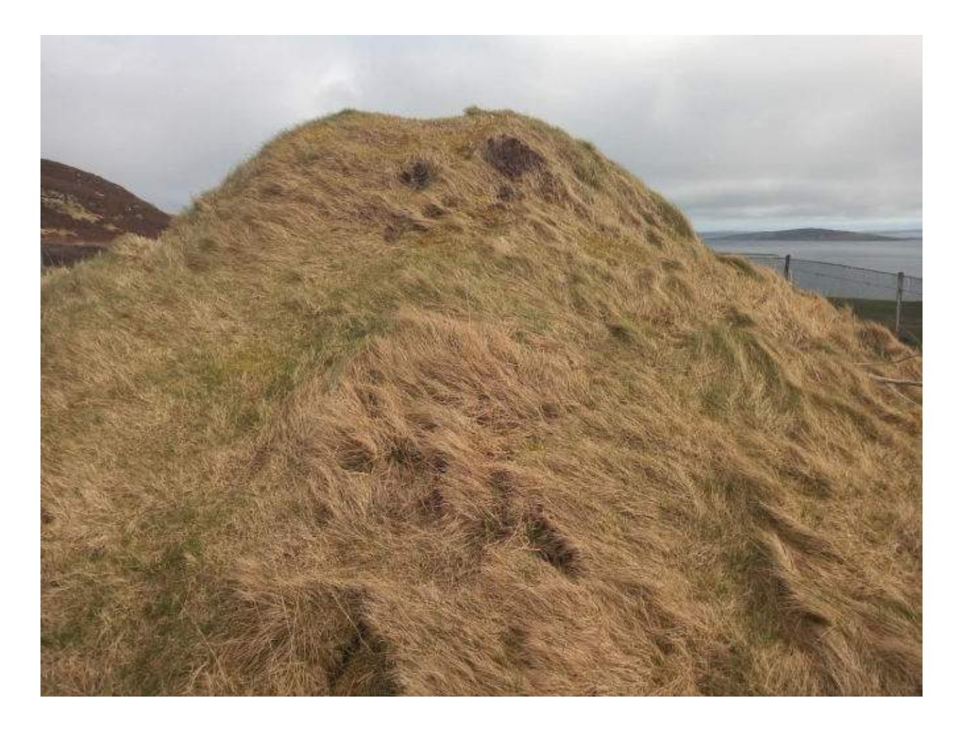
Plate 31: View southeast showing effect of raised, bunker roof on the Knowe of Yarso Chambered Cairn, Rousay, HES PiC (Asset 128)