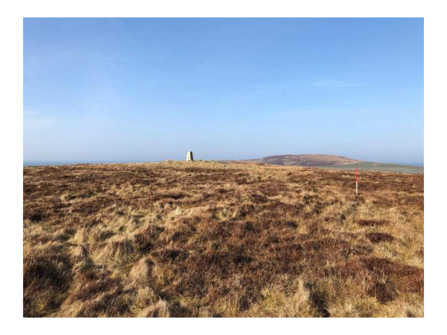
Plate 3: View northeast within Hundland Hill Enclosure (Asset 65) showing Ordnance Survey Trig Point in centre of Scheduled area