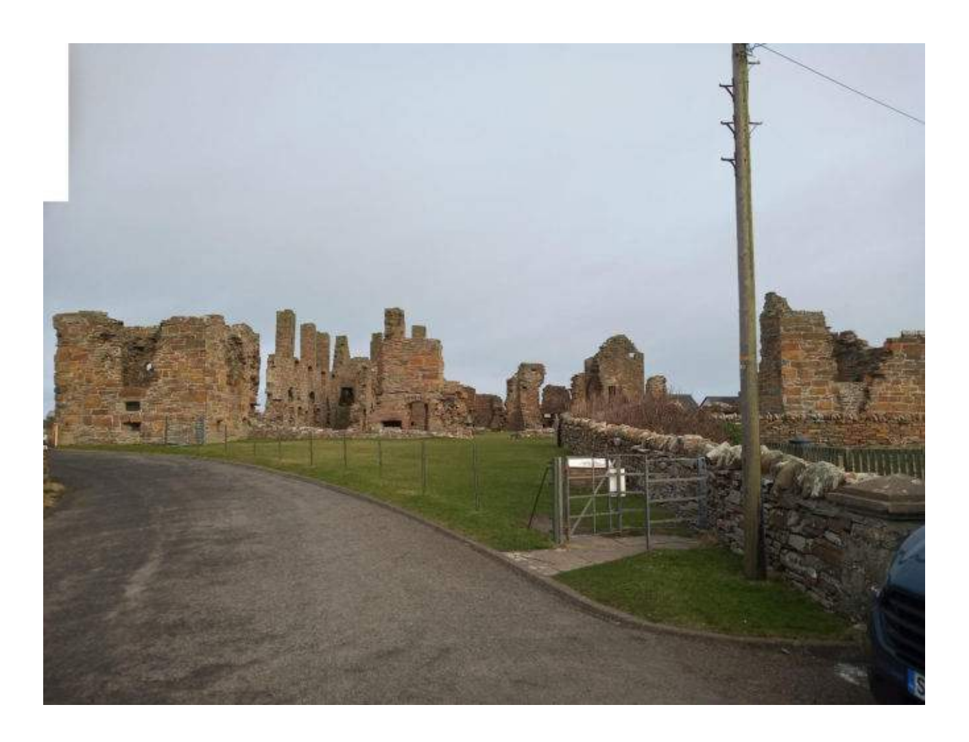
Plate 22: View north of Earl's Palace HES PiC (Asset 123)