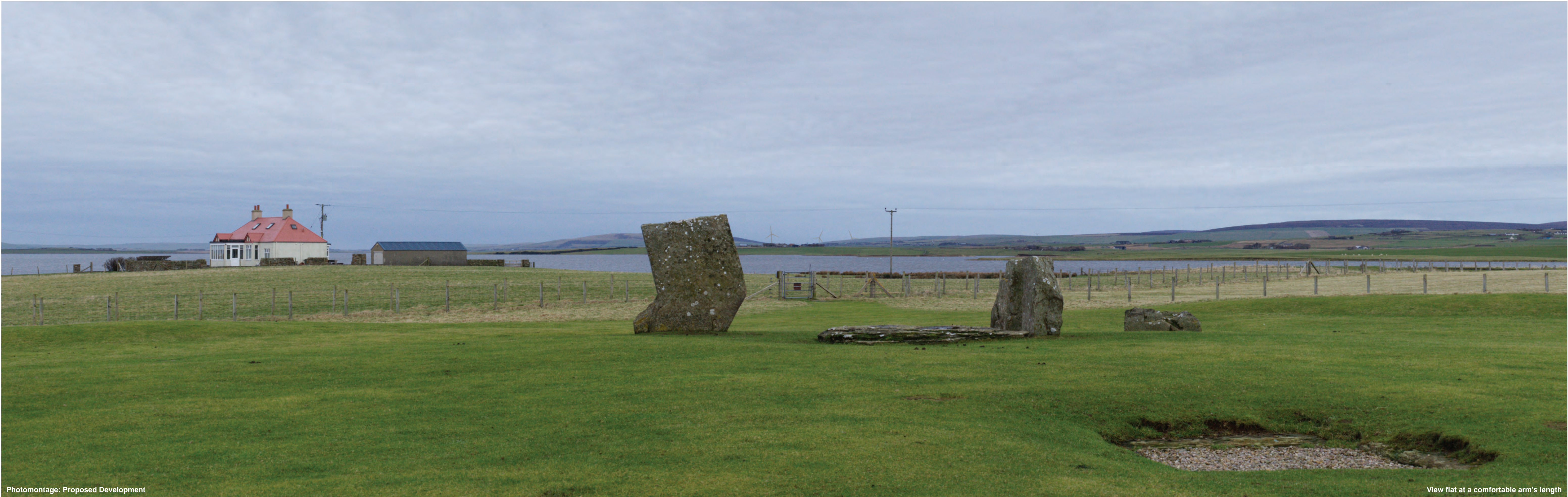
Photomontage: Proposed Development