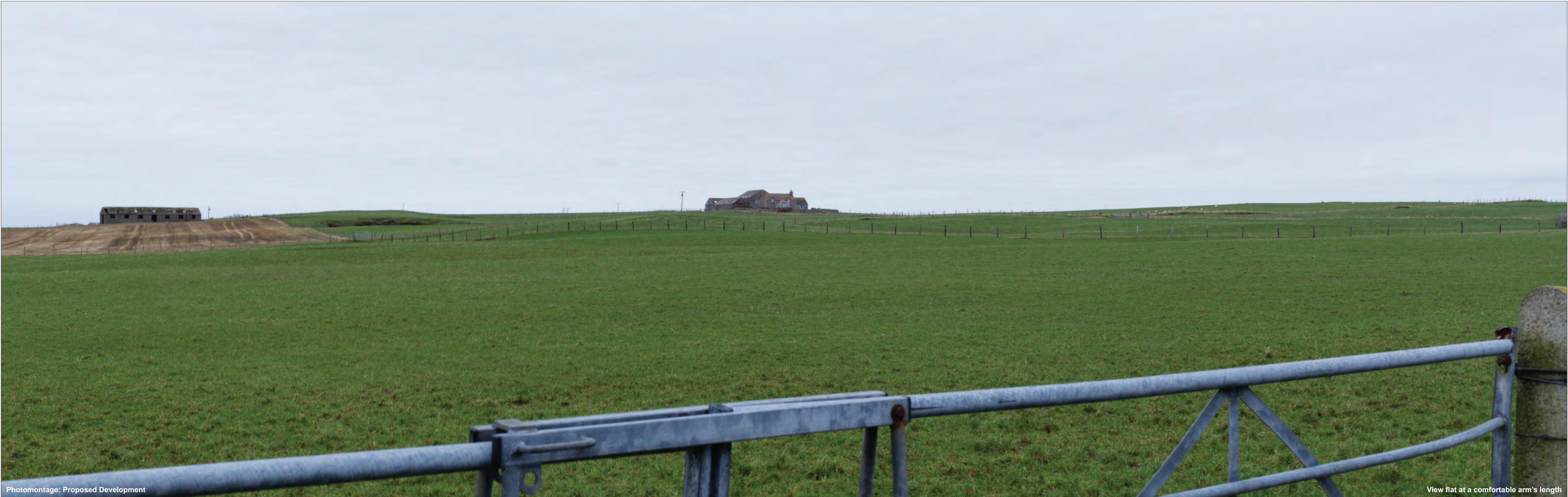
Photomontage: Proposed Development