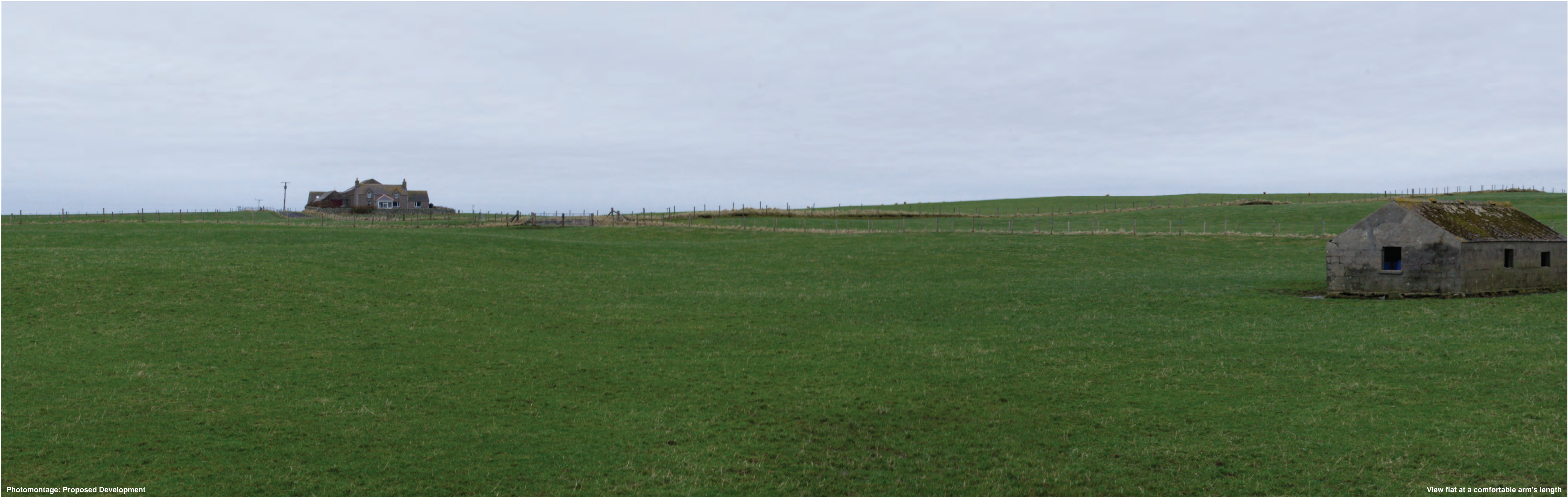
Photomontage: Proposed Development